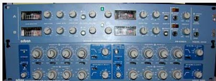
The ORBAN notch filter is the bottom unit

You can see the ORBAN units installed on the photo on the home page.