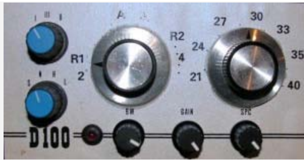
My own D100 front

Performance: Boy is it sensitive compared to the televisions I have. I'm sure if you look at my dxtv screen shots, you would agree the old telly's are by no means rubbish, but the D100 certainly gives a weak locked picture sometimes before there are even sync lines on the old Pye TV. But I have been unable to test it properly in anger so far. Surely but surely we will have a decent opening on band one before the final end to the traditional summer sporadic e season.